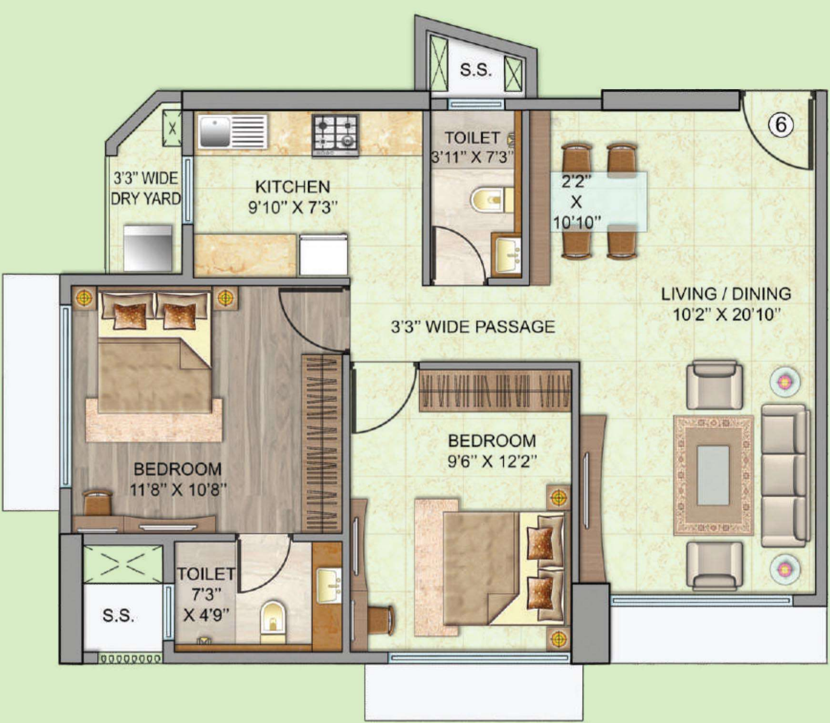
2 BHK UNIT PLAN 30 th to 40 th Floor

RERA Carpet Area: 659.50 sq.ft. Deck Area: 17 sq.ft.