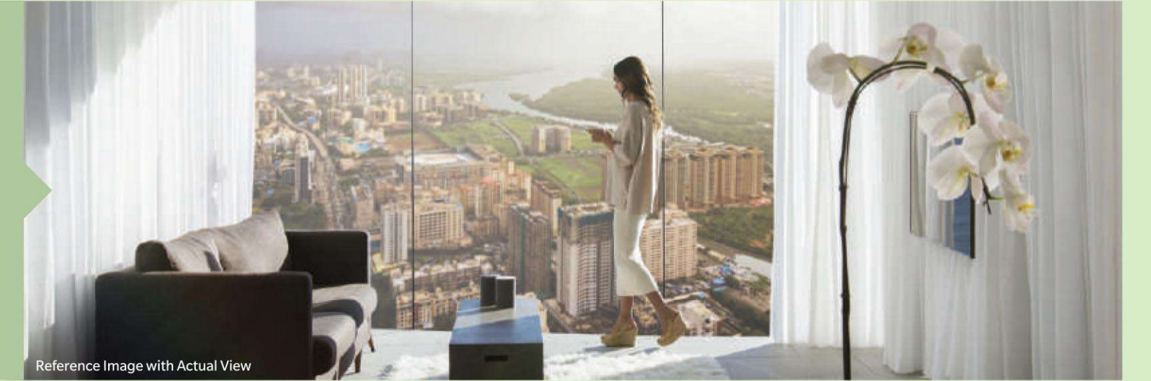
Reference Image with Actual View